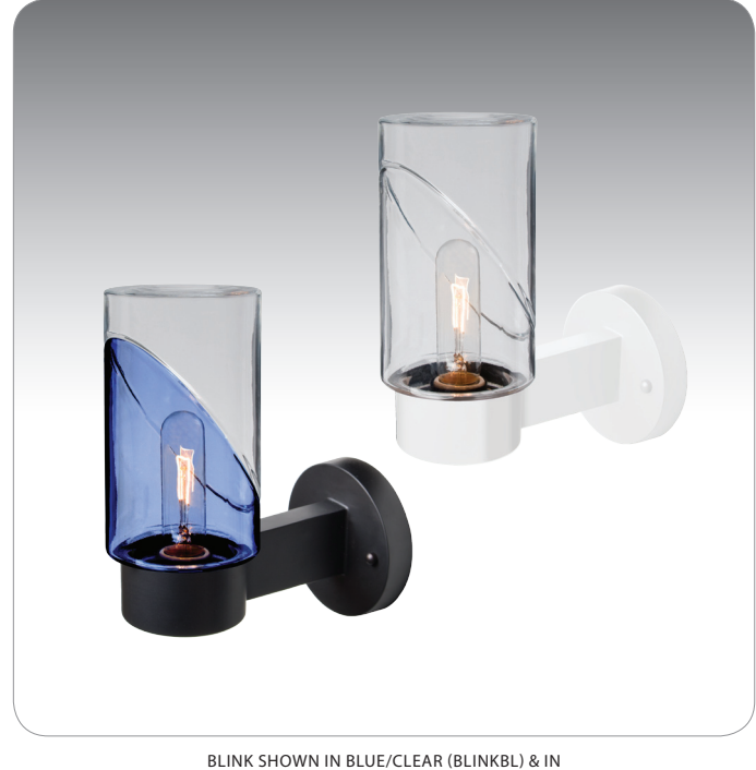
BLINK SHOWN IN BLUE/CLEAR (BLINKBL) & IN CLEAR (BLINKCL)