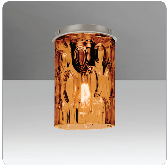
CRUISE CEILING SHOWN IN AMBER (CRUISEAMC)

UL or ETL Listed. Suitable for Damp Locations (interior use only).