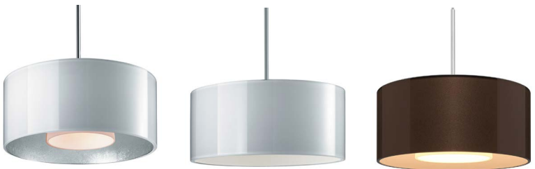
504 white outer/silver inner 505 white outer/white inner 507 bronze outer/white inner