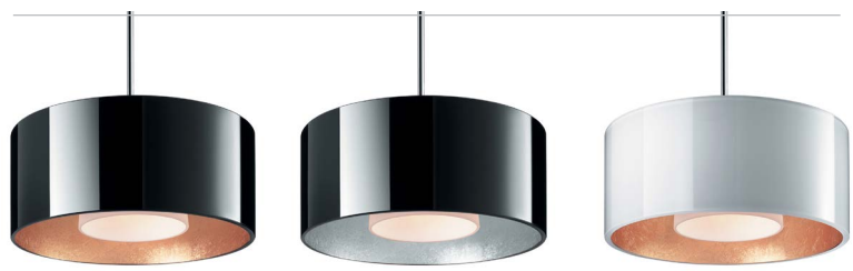
501 black outer/gold inner 502 black outer/silver inner 503 white outer/gold inner