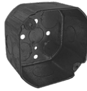
Fire Rated J-Box

Note: A 2-1/8" deep octagon junction box is recommended for through circuit wiring applications.