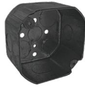
Fire Rated J-Box

Note: A 2-1/8" deep octagon junction box is recommended for through circuit wiring applications.