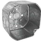
4" Octagonal (Metal)