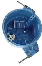
3.5" Round (Plastic)