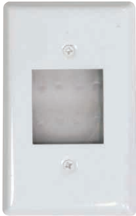
SE106-LED DIFFUSE GLASS LENS