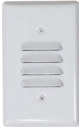
SE107-LED ANGLED LOUVERS