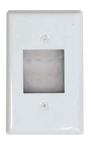
SE106-LED DIFFUSED GLASS LENS