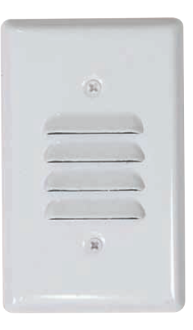
SE107-LED ANGLED LOUVERS