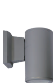
MCL3D (DOWN TYPE)