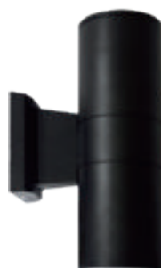
MCL3-UD (UP/DOWN TYPE)