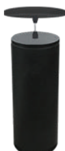
MCL3 (PENDANT DOWN TYPE)