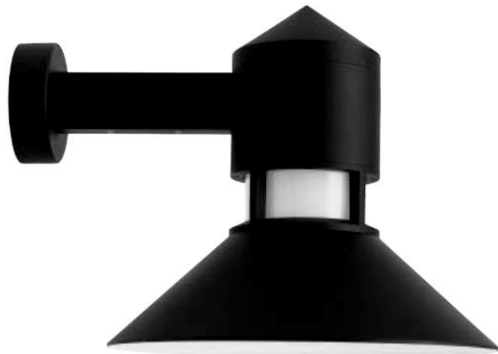
shown with straight arm mount (-WA)