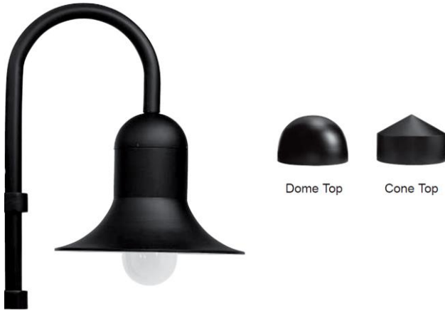
shown with shepherd's crook wall mount