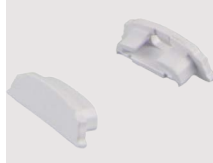
End cap with hole End cap without hole