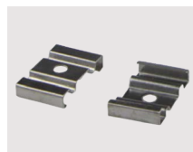
Mounting clip (CP)