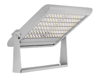
AUR-450 Trunnion mount