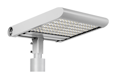
AUR-450 Slip Fitter mount