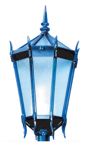
Kensington w/ optional decorative spikes (SK) and transparent panel top (TP)