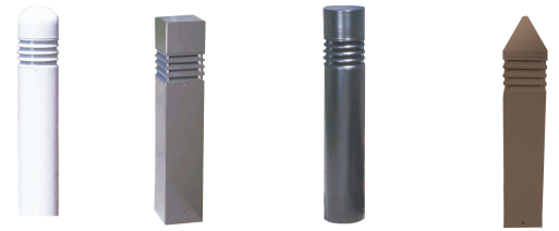
Round w/ dome top Square w/ flat top Round w/ flat top Square w/ pyramid top