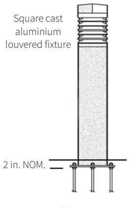
(4) ½ in. X 12 in. Galv. Steel Anchor Bolts W/ Washers Astm F1554 Grade 36