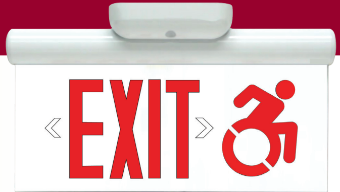
Meets the requirements of the State of Connecticut Building Code Para. 1011.1.2

Now incorporating the new "dynamic character leaning forward" symbol as required in Substitute House Bill No. 5050, Public Act No. 16-78 "An Act of Modernizing the Symbol of Access for Persons with Disabilities"