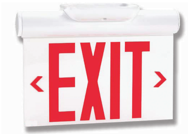
matching 6" exit sign available