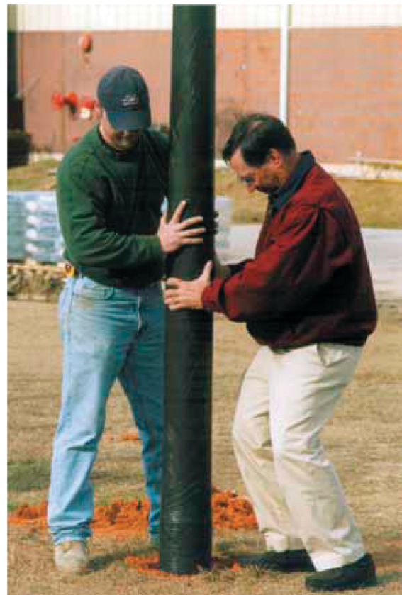
The Pole Top Section slips easily over the Tuff-Stub base.