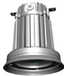
Box Mount Vaporproof