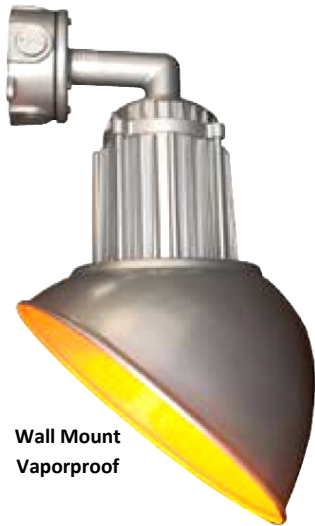
Wall Mount Vaporproof