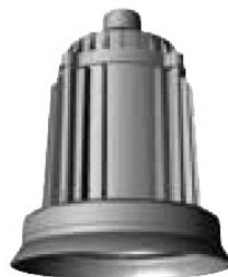
Pendant Mount Vaporproof