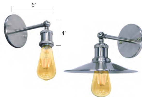
Shown with optional CTMC200-NK shade

Combine with our Vintage Pendants (RLM81) and Ceiling Mount Luminaires (CM81) to evoke classic lighting in any space