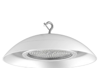
Hanging Hook Mount (Standard) [HM]