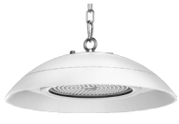
Loop Mount [Chain Not Included] (Option) [LM]