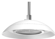
Pendant Mount [Stem Not Included] (Option) [PM]