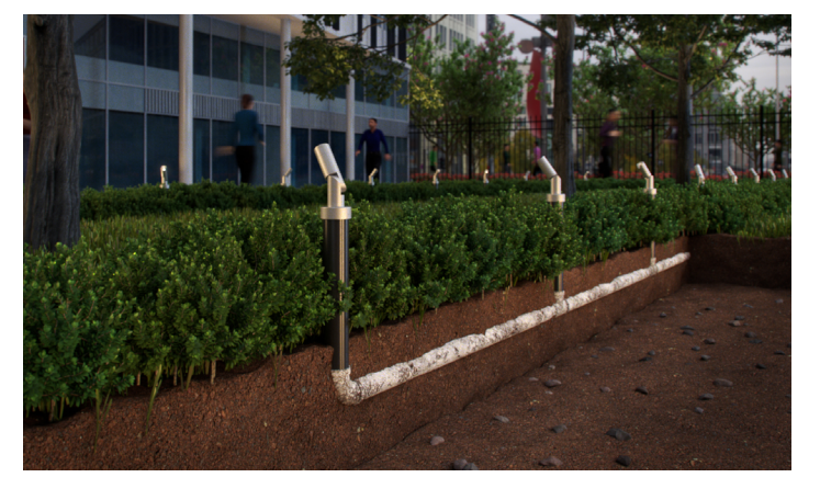
L930 B2 | Landscape | Complete Installation