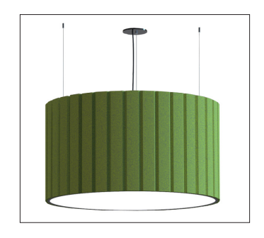
FV - FLUSH VCUT