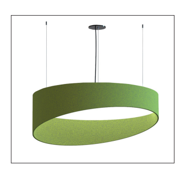
RA - RECESSED ANGLE