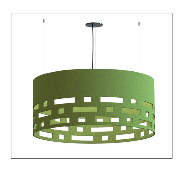
RP - RECESSED PERFORATED