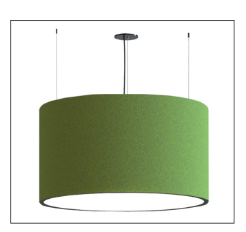
FR - FLUSH REGULAR