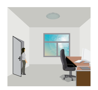
1. No motion detected, all lamps switch off.

The sensor is an innovative motion sensor, switch on the light on detection of movement, and switch off after a hold time when there is no motion detected.