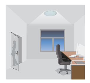
3. No motion is detected in detection area, all lamps synchronously dim to a low light level after hold time.