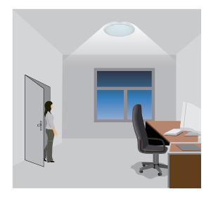
2. Any movement is detected from any direction, all lamps synchronously switch on.