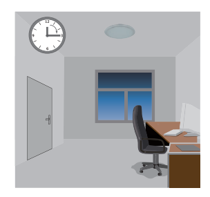
4. After stand-by period, the lamps switch off if no movement is detected in the detection zone.