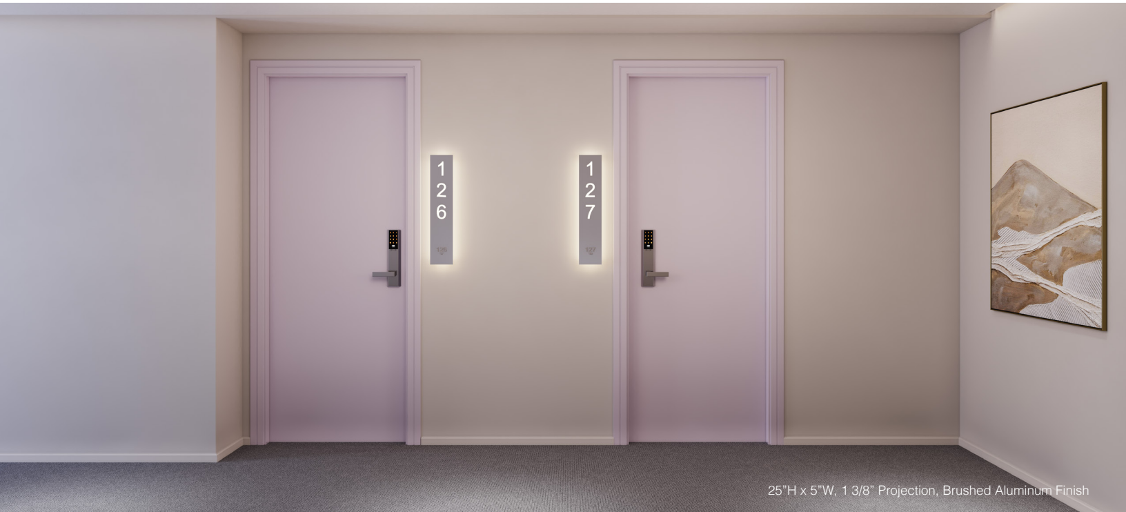
25"H x 5"W, 1 3/8" Projection, Brushed Aluminum Finish