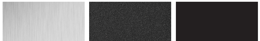
BRUSHED ALUMINUM, BA