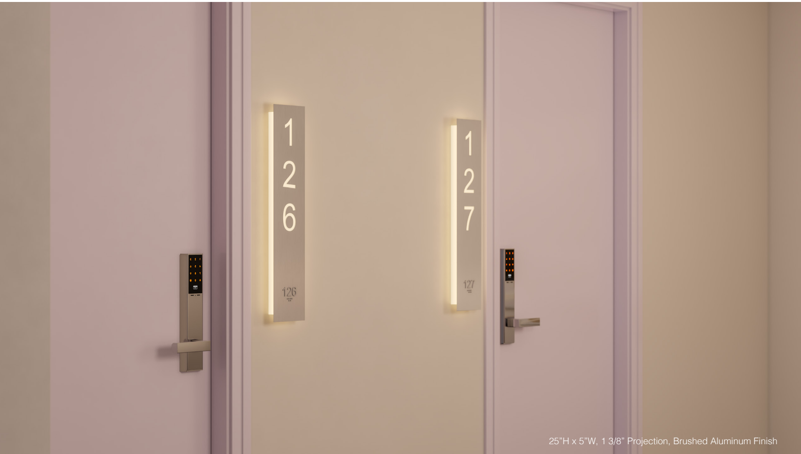
25"H x 5"W, 1 3/8" Projection, Brushed Aluminum Finish