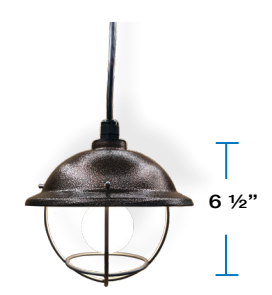
DDRG 8 8" DIAMETER