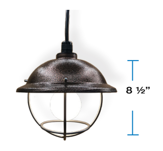
DDRG 12 12" DIAMETER