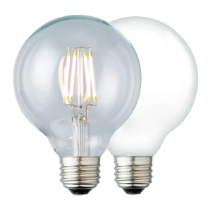
G25, 3.5W, 350L G25/C/24/350 24K CLEAR G25/W/24/350 24K, WHITE G25/C/27/350 27K, CLEAR G25/W/27/350 27K, WHITE