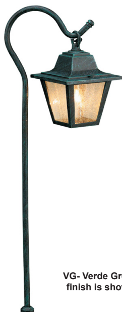
VG- Verde Green finish is shown

Limited one (1) year warranty on fixture housing and and stem against manufacturer's defects.