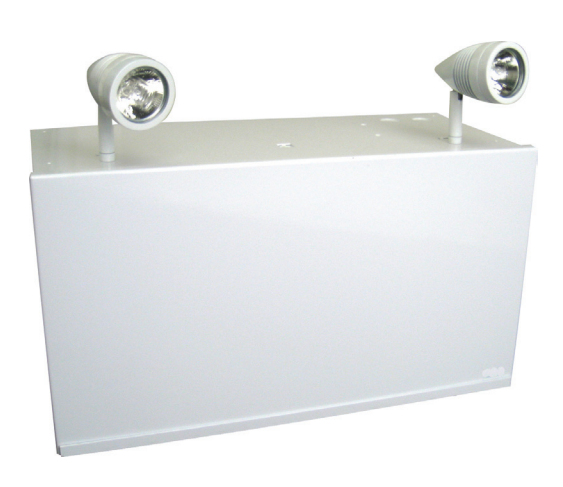
Shown with optional MR16 lampheads and now available with LED