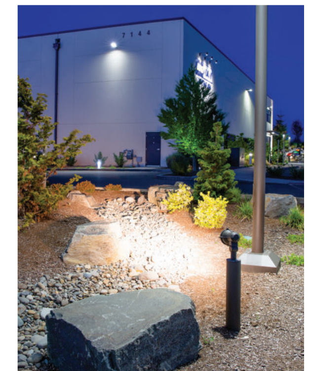
CRL Concentric Ring Louvre