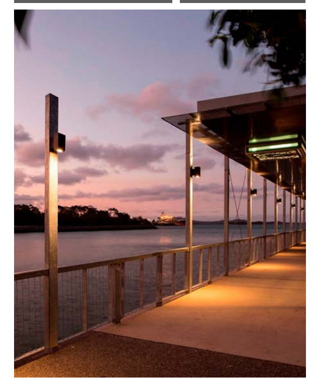
RPA Round Pole Adapter