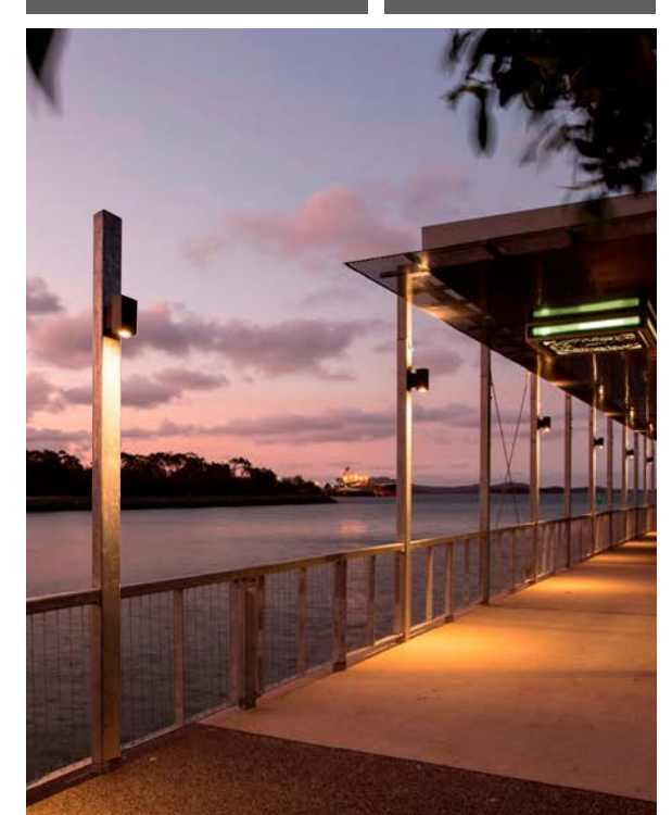
RPA Round Pole Adapter