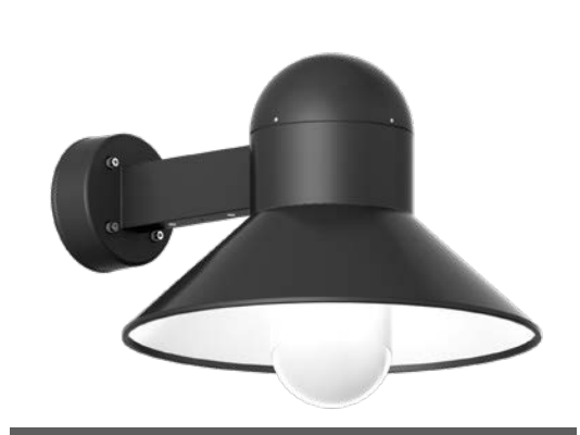
41w COB 2636 Lumens | 29w COB 1856 Lumens IP55 • Suitable For Wet Locations IK04 • Impact Resistant Weight 20 lbs