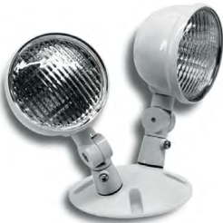
DIMENSIONS: 9-1/4" x 7-1/4"