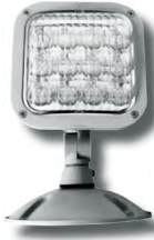
DIMENSIONS: 4-1/2" x 6-5/8"