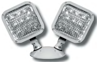
DIMENSIONS: 10-3/8" x 6-3/4"