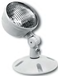
DIMENSIONS: 4-1/2" x 6-7/8"