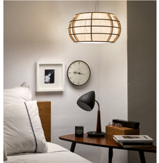
REF. KIM SP LED 20 Kim Small