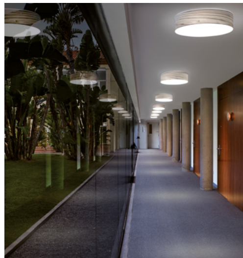
REF. G42 A LED 29 Gea Large