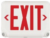
EVC Combo Exit/ Light