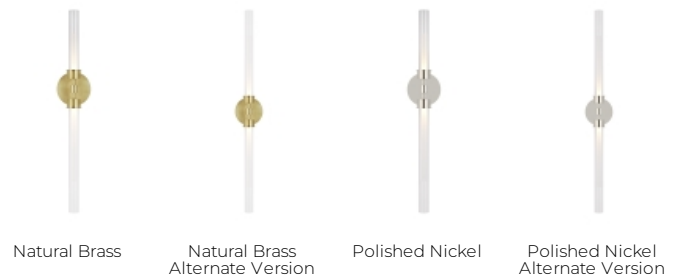
To view all available finish options, please visit techlighting.com

Includes 120 volt 17.4 watts, 1144.8 delivered lumens, 3000K LED module. Dimmable with most LED compatible ELV and TRIAC dimmers. 277V compatible with 0-10V dimmers. Mounts horizontally or vertically. ADA compliant. Ships with (1) 7.5IN and (2) 13.5IN additional pieces of glass for customization.