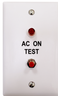
CRTS - Remote Test Switch