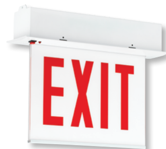
Recessed Ceiling Mount