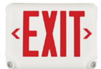
EVC Combo Exit/ Light