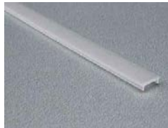
White lens (WH) White continuous lens (SWH)