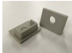
End caps with hole X2 (EC)