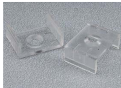
Mounting clip X5 (CP)