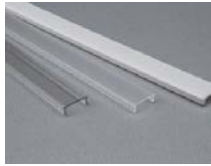
Clear lens (CL) Frosted lens (FR) White lens (WH)