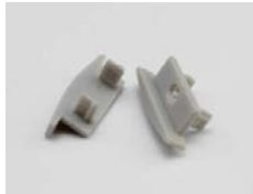
End cap with hole End cap without hole