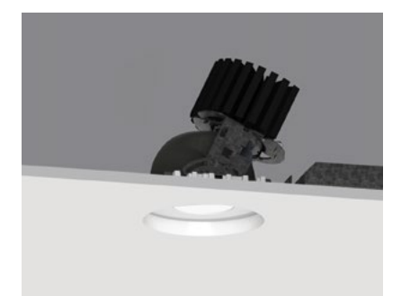
Recessed Plaster Trim