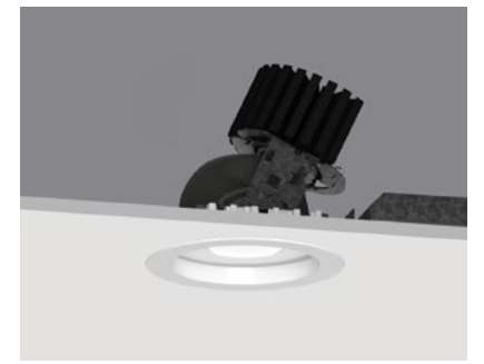
Recessed Bezel Trim