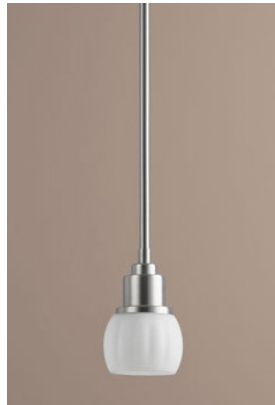
-14 Polished Chrome