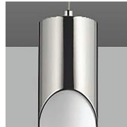
-20 Polished Nickel