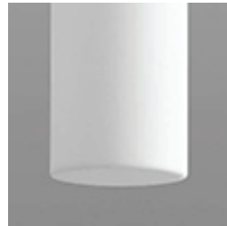
-1 White Opal Glass -2 Matte White Acrylic