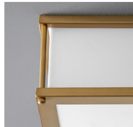
-40 Aged Brass