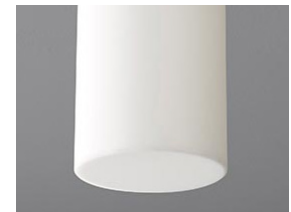
-2 Matte White Acrylic