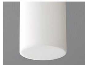
-1 White Opal Glass