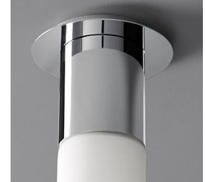
-20 Polished Nickel