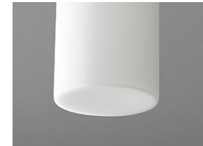
-2 Matte White Acrylic