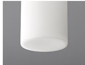
-1 White Opal Glass