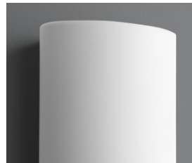
-2 Matte White Acrylic