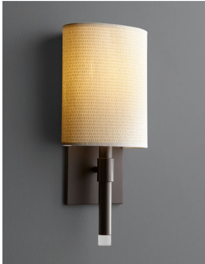
-95 Old World