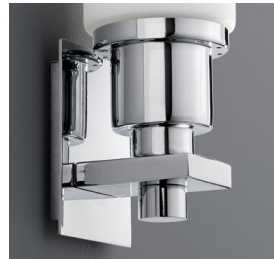
-14 Polished Chrome