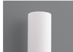
Matte White Acrylic